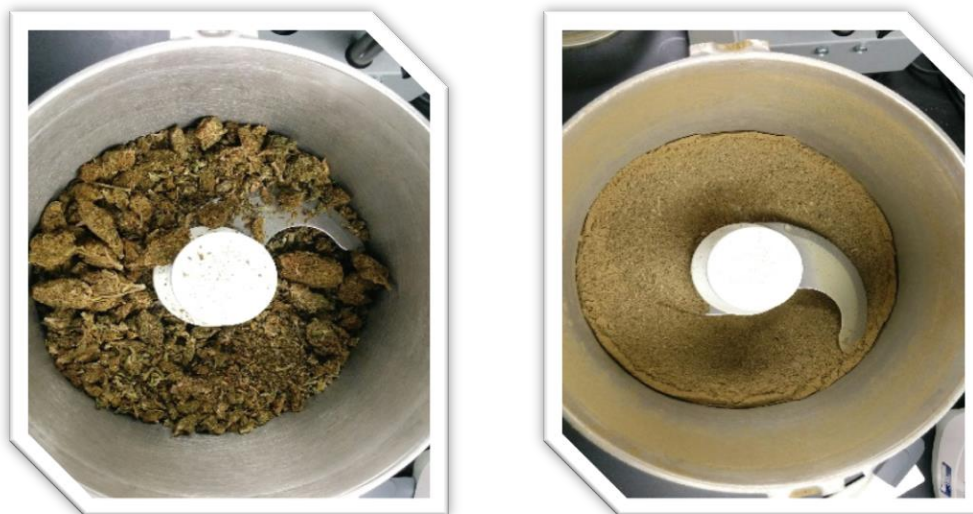
Figure 1. Hemp sample before (left) and after (right) homogenization with dry ice.

Hemp should be ground to a fine powder using cryogenic milling (e.g. SPEX 6775 Freezer/Mill®). For this work a large quantity (100 g) of hemp was thoroughly blended in a Robot-Coupe® using dry ice to generate a homogenous sample for use during method development and recovery experiments.