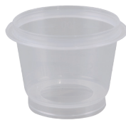
Millipore, 100 ml / 250 ml Microfil® disposable plastic funnel (MIHAWG100 / MIHAWG250)