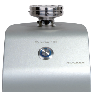
WaterVac 100 - MB Vacuum Filtration System (190120-01/02) (US plug / EU plug)