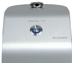
WaterVac 100 Vacuum Filtration System (190100-01/02) (US plug / EU plug)