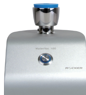
WaterVac 100 - MS Vacuum Filtration System (190110-01/02) (US plug / EU plug)