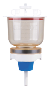
Rocker, 300 ml MF 3, Magnetic Filter Holder (200300-01)