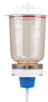
Rocker, 500 ml MF 5, Magnetic Filter Holder (200500-01)