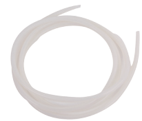
Silicone Tube Ø 4.2 x 8 mm, 200 cm (199100-68)