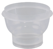
Sartorius, 100 ml / 250 ml Microsart® disposable plastic funnel (16A07--10-----N/ 16A07--25-----N)