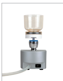
Improve operation time