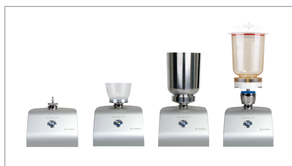
Compatible with various kinds of adaptor and filter holder