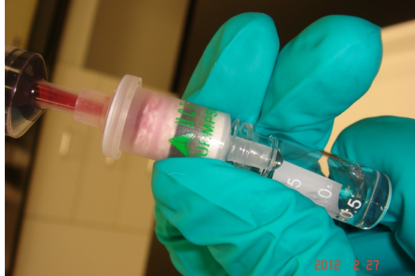
Quick QuEChERS before (left) and after (right) clean-up of 1 mL red wine extract