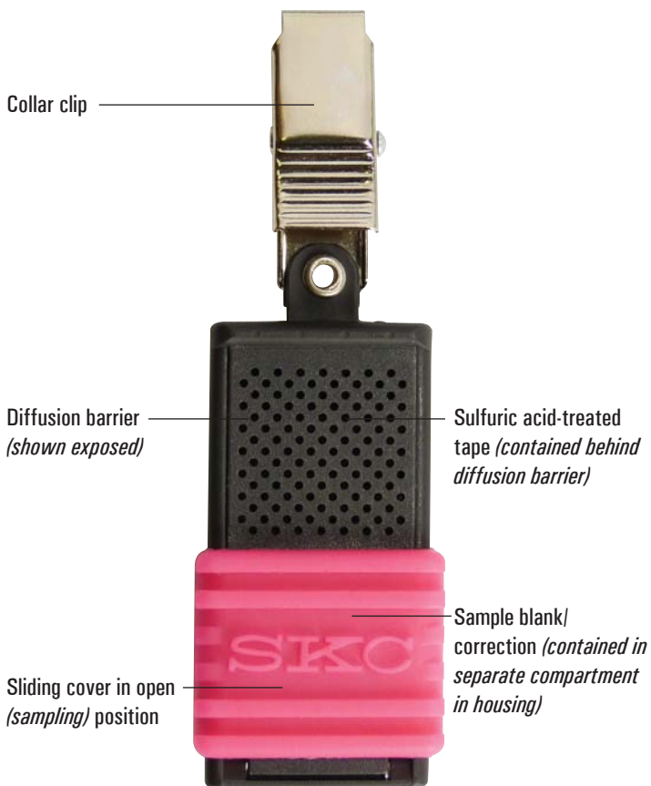
UMEX 300 Sampler with sliding cover in sampling position